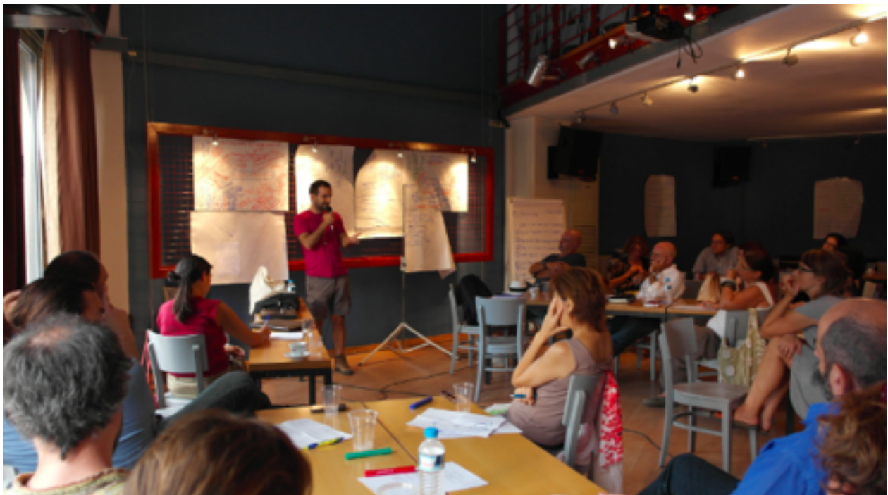
Meeting in Athens with the movements and solidarity-based initiatives, September 2014